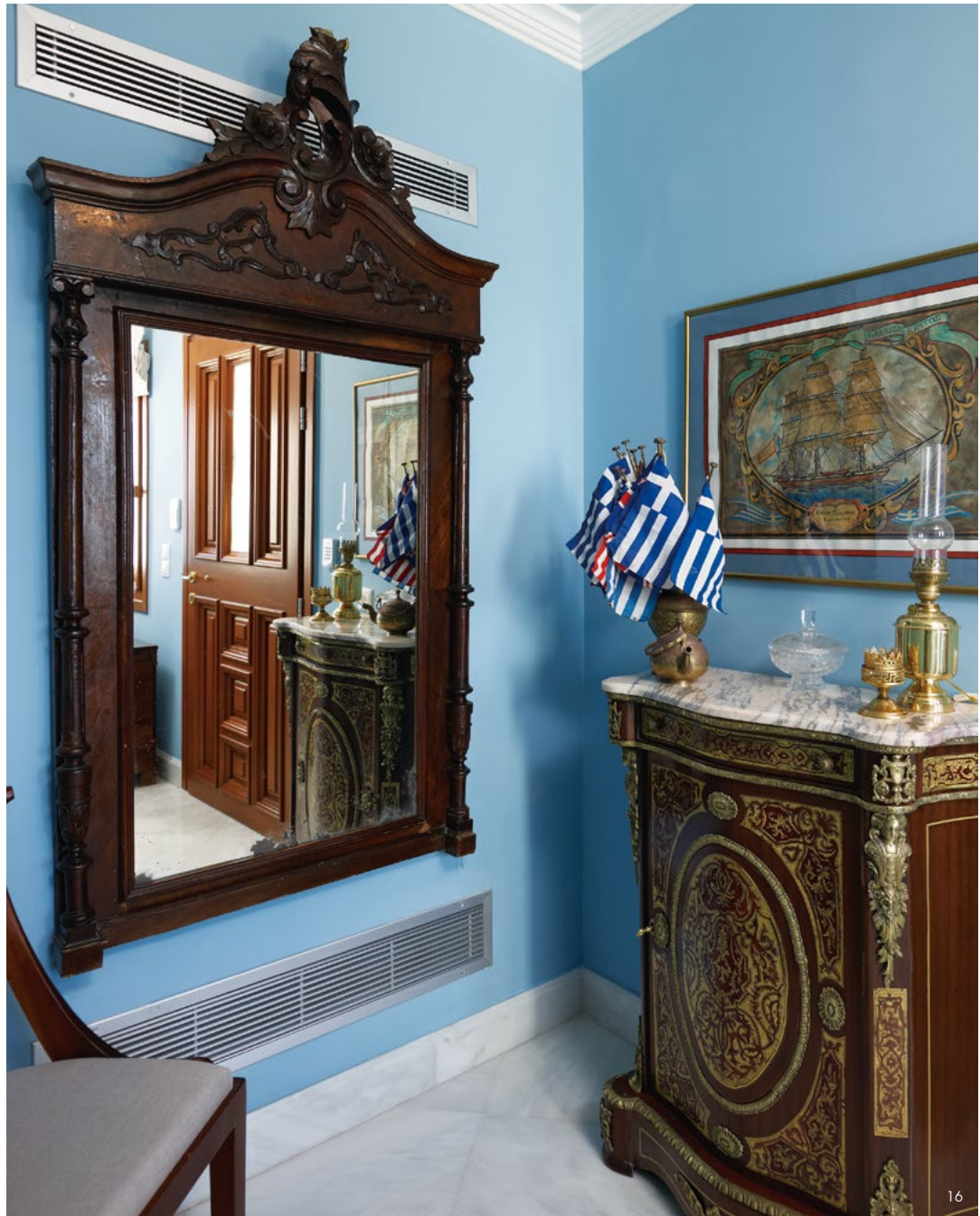
12-13 / "Green mint" guestroom 14 / Office space 15 / Living room with naval antiques 16 / Nineteenth-century marquetry side cabinet