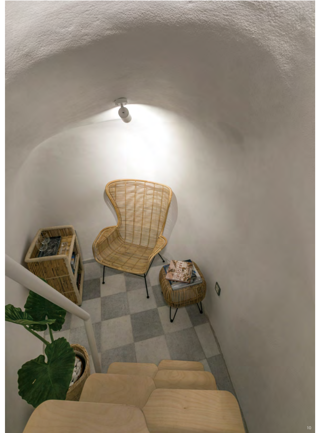
08 / Living room with kitchen 09 / Inside master bedroom 10 / Old cistern with bamboo armchair